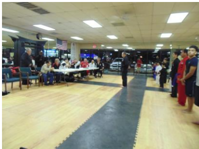
Special guest at Black Belt testing