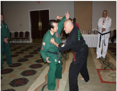
Beginning of fan block against punch