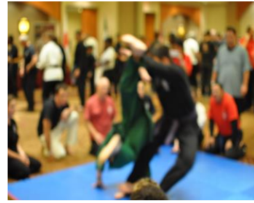
Rolling Snake Strike to face Takedown