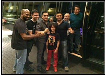
Boarding party bus for dinner