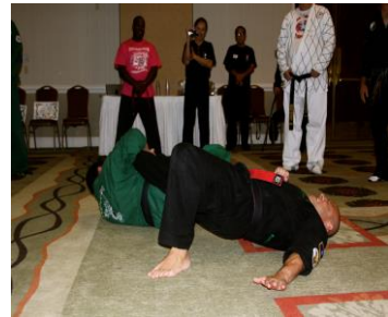
Leg against hip knee break