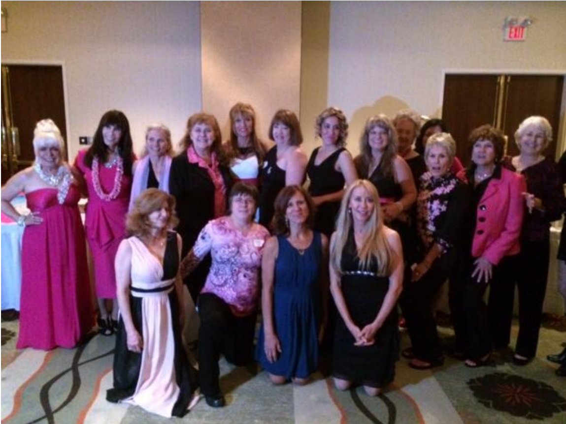
Some of the lady warriors of sport karate that were honored by the National Sport Karate Museum