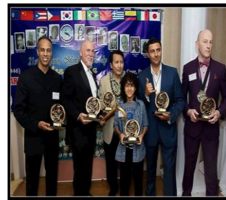
Some of awardees posing for pictures after banquet