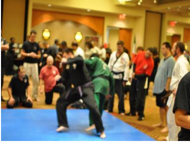
Spinning Calf Throw