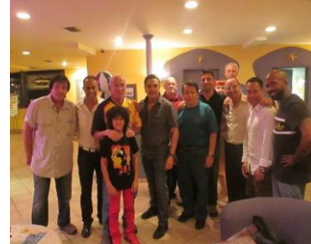
Group shot at restaurant